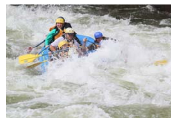
Recreation day activities