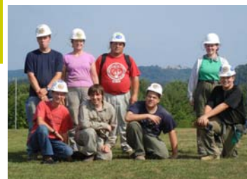
Summit crew after a hard day's work

Lastly, everyone liked seeing how the week started off with trees and forest, and finished with beautifully groomed bike trails. Over all Summit Corps 2011 was a great learning experience, and leadership building adventure. We all hope that everyone will get to ride on our awesome trails at the 2013 Jamboree. Great job Ho-Dee-No-Sau-Nee!