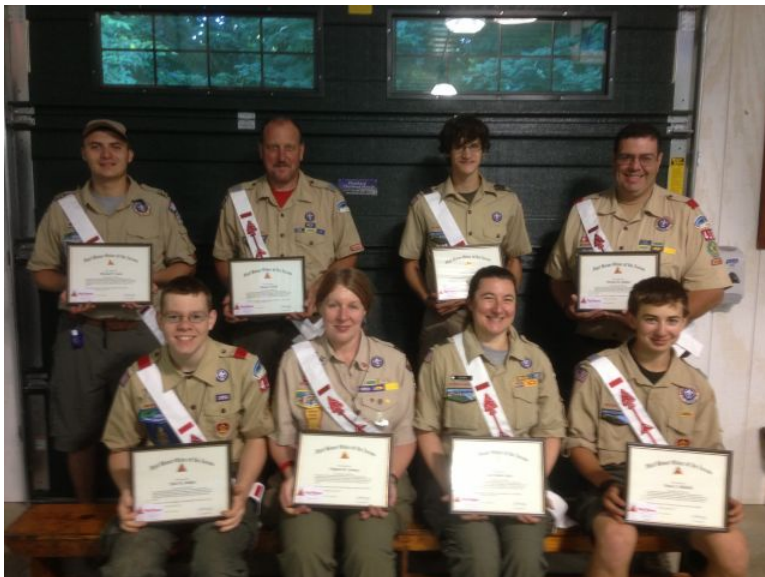
Vigil Class of 2013