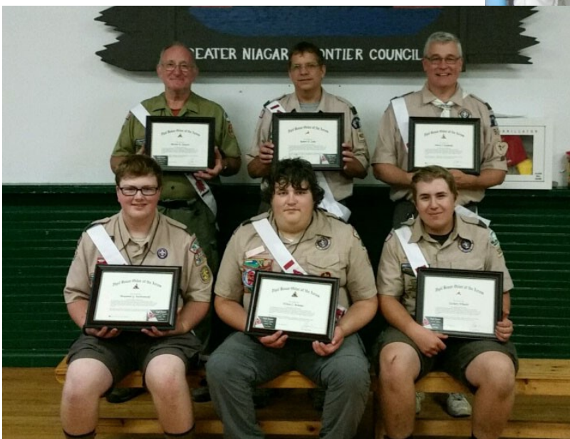
Vigil Class of 2016